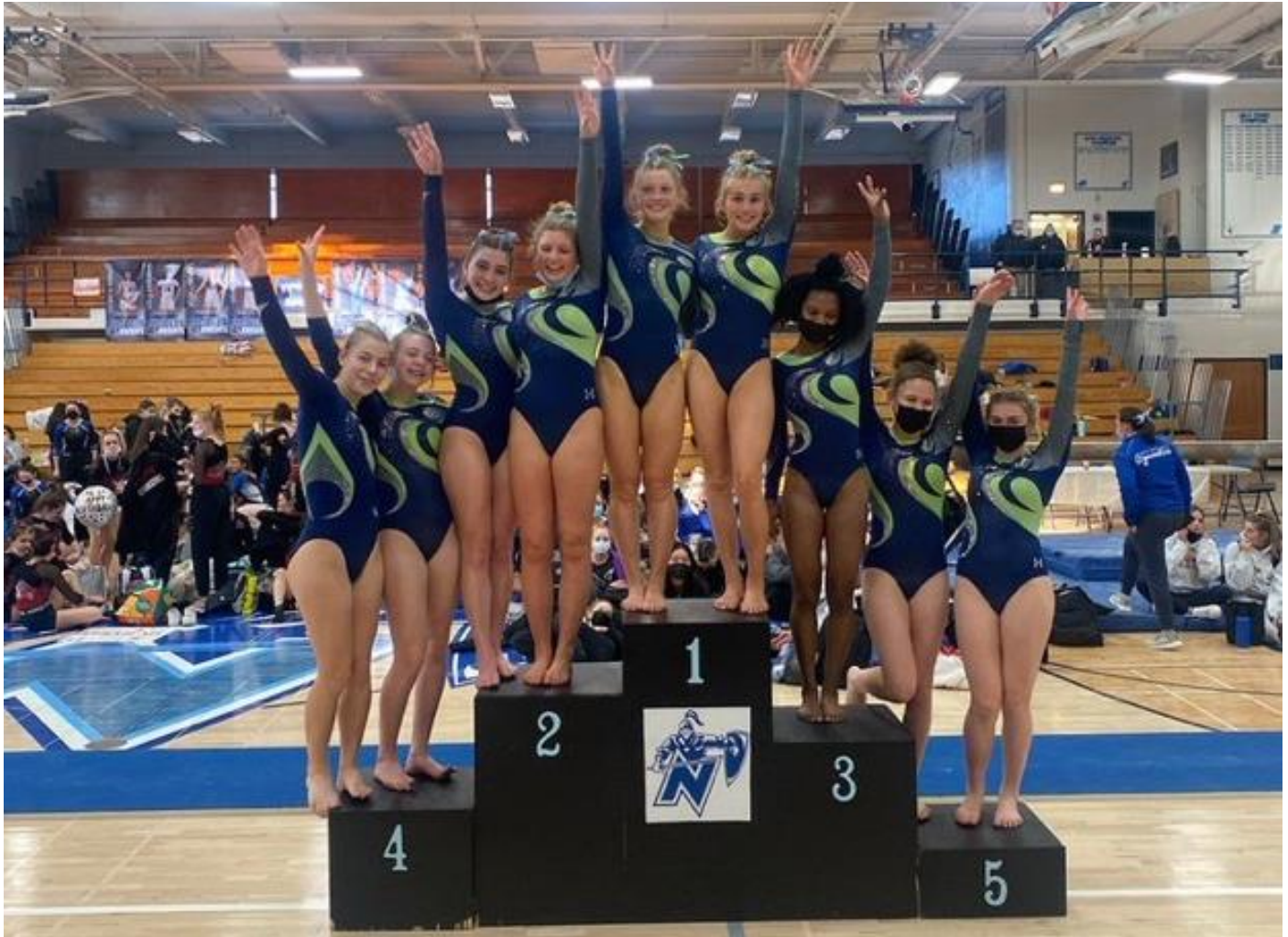
North Shore Conference Championship

The first part of their postseason run took place at Nicolet High School for the North Shore Conference meet on February 19 th . The Blue Dukes won the meet with a score of 140.025, which was 0.65 better than runner-up Homestead. The Blue Dukes got contributions from the entire team to pull over this victory.