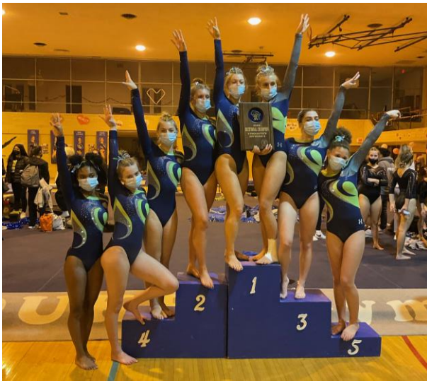
WIAA Division 2 Sectional Champions